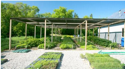
New Potting Shed