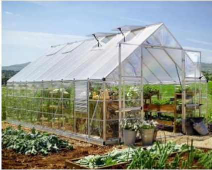
Modular Greenhouse to replace existing Structure No. 6