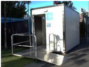
New Modular Accessible toilet