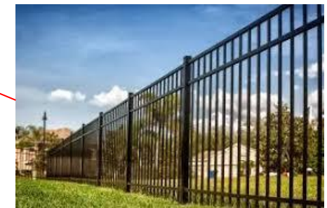
Perimeter Fence to replace existing dilapidated fence