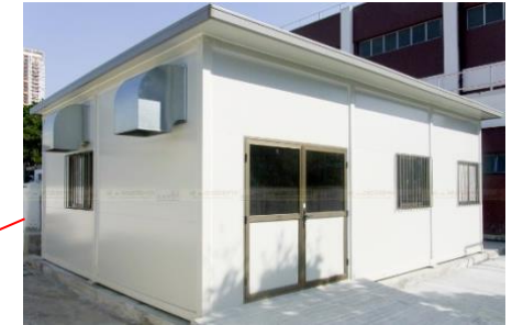
New Modular Classroom