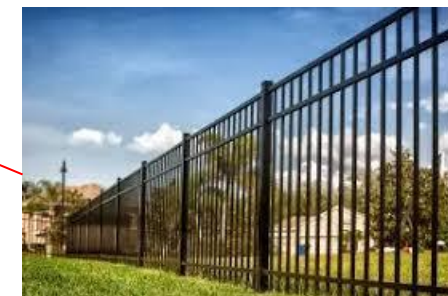
Perimeter Fence to replace existing dilapidated fence