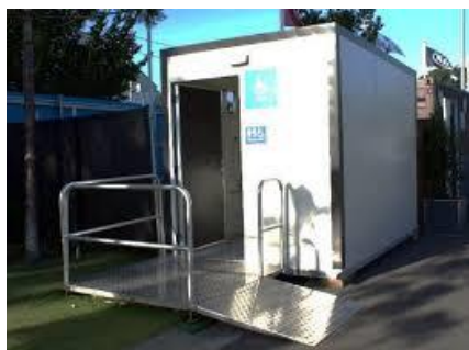
New Accessible Toilet