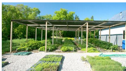
New Potting Shed