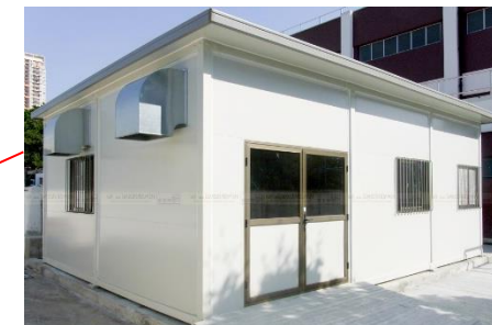
New Modular Classroom