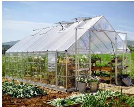
Modular Greenhouse to replace existing Structure No. 6